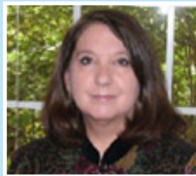
Donna Carol Fink Chair